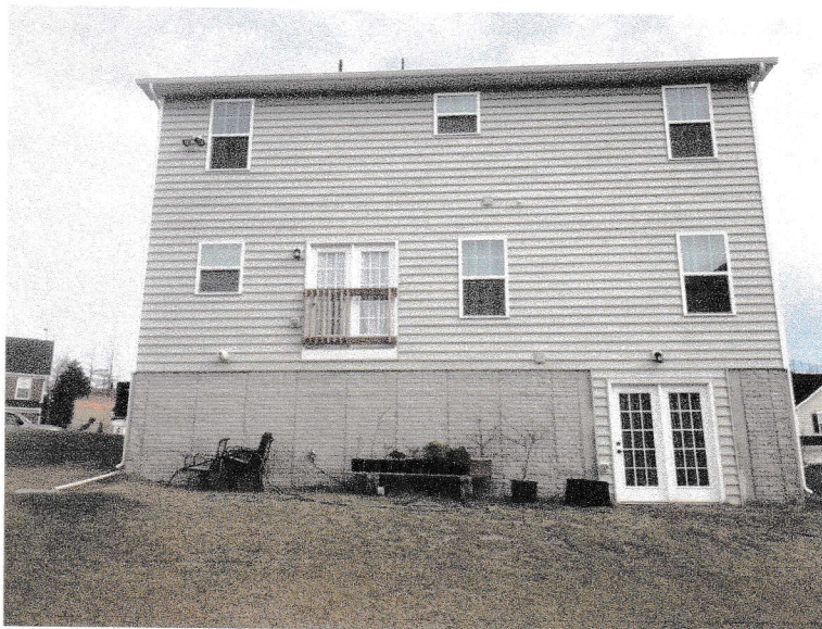
Rear view of property 1021 cook drive SE

Emilio Vasquez Blakeney Vasquez 1021 Cook Drive SE Washington DC 20032